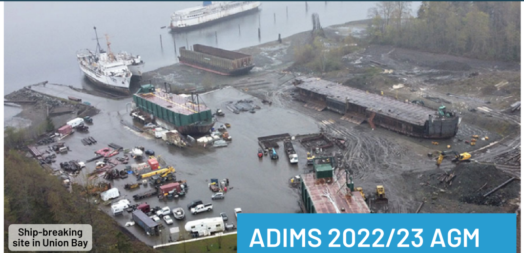
Ship-breaking site in Union Bay

ADIMS opposes the Union Bay ship-breaking operation and strongly supports Concerned Citizens of Baynes Sound's fight against this industry which threatens to pollute our marine ecosystem. We did two presentations at their rallies on the key ecological role of Baynes Sound, where we shared information with Islanders, and joined demonstrations. We wrote both senior governments asking them to fix this situation, as it endangers migratory birds, spawning herring, local salmon streams, and human health. This foreign-owned ship-breaking operation is responsible for four environmental violations and two environmental spills. They have received two cease and desist orders. In 2022, the BC Minister of the Environment issued three warnings and one advisory for discharging hazardous waste into the marine environment. The CVRD applied for a permanent injunction to the BC Supreme Court to permanently stop ship-breaking on these lands.