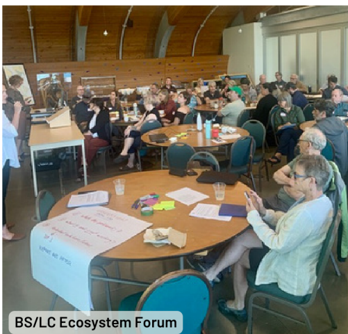
BS/LC Ecosystem Forum