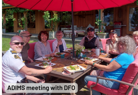
ADIMS meeting with DFO

Recent Forums have focused on the impact of human waste on the marine ecosystem. The importance of collecting and organizing data and knowledge will be the theme for our upcoming Forum in November 2023.